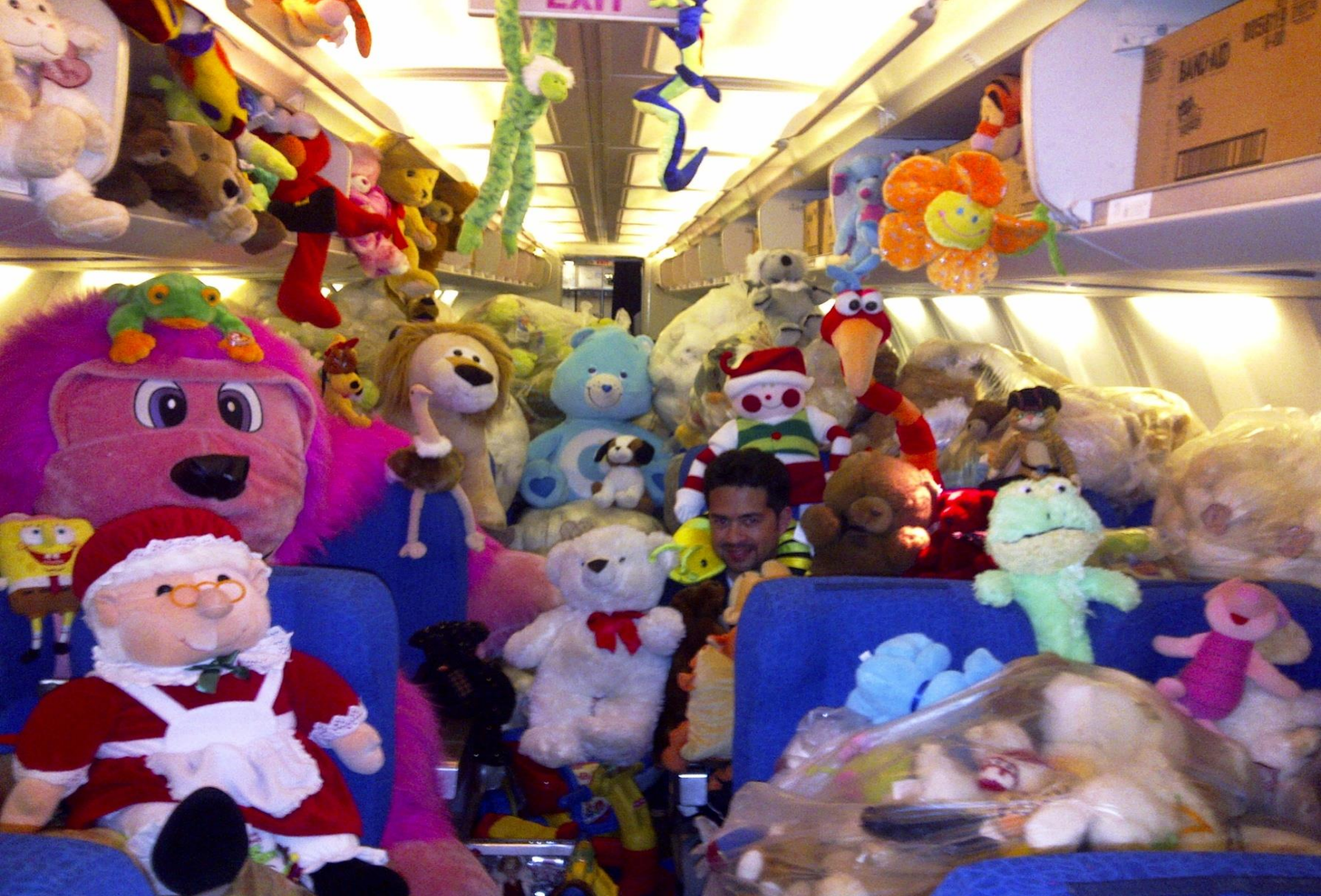
10,000 toys & tons of medical supplies booked a flight from Phoenix Arizona to Baghdad Iraq on Al Naser Airlines new Boeing 737 Aircraft. Final, Destination, in the hands of Iraqi orphans.