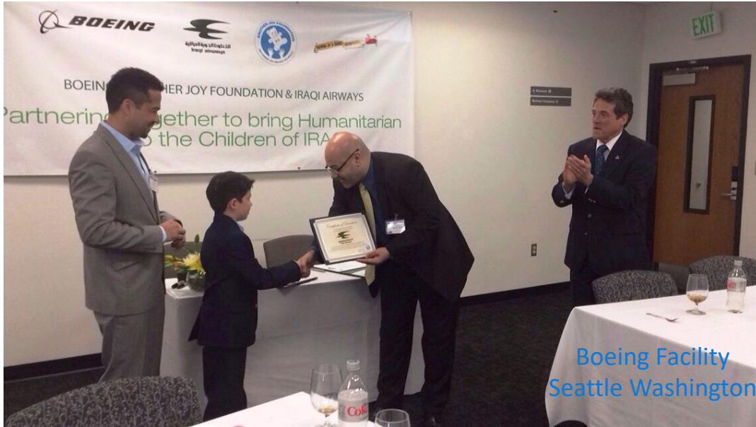
Boeing Facility Seattle Washington