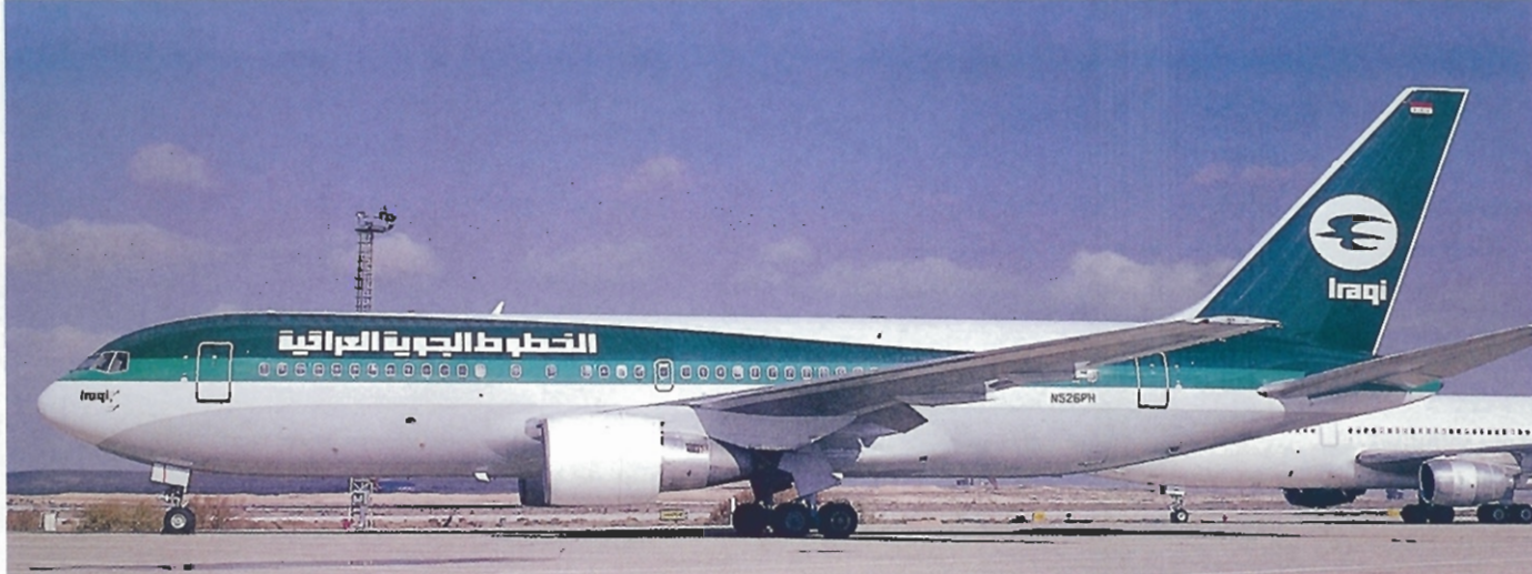
Boeing 767-200 N526PH was reregistered 9L-LFF shortly after its arrival in Jordan.