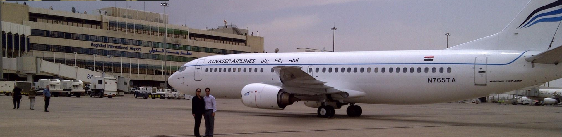
After complete refurbishment in the USA, the Aircraft was delivered to Baghdad Iraq ready for operations.