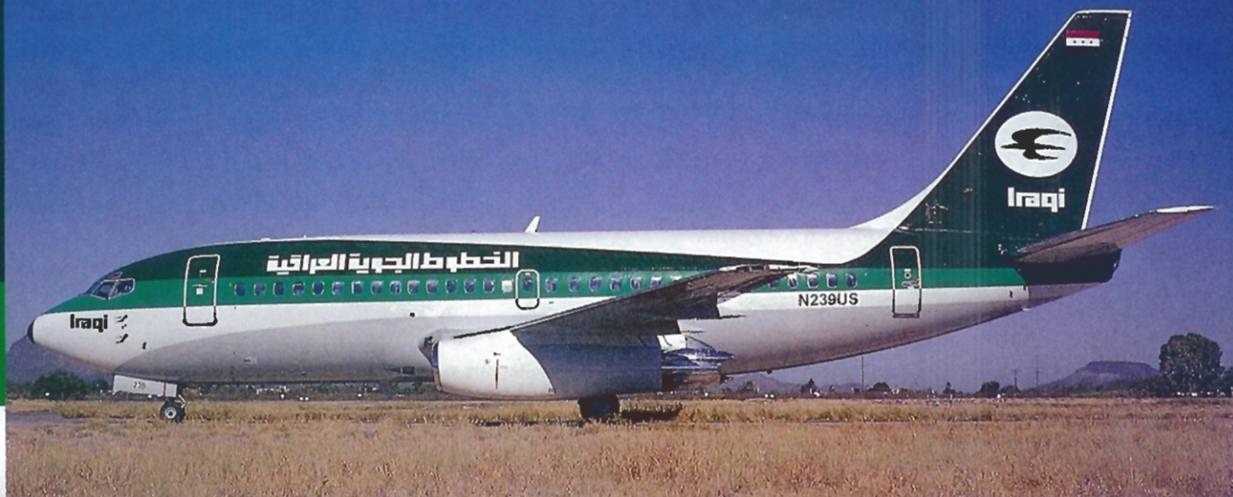
The first Boeing 737-200, N239US c/n 22354, in Iraqi Airways colours, to be refurbished by Hamilton Aerospace Technologies, in Tucson, Arizona, prior to its departure for the Middle East in October 2004.