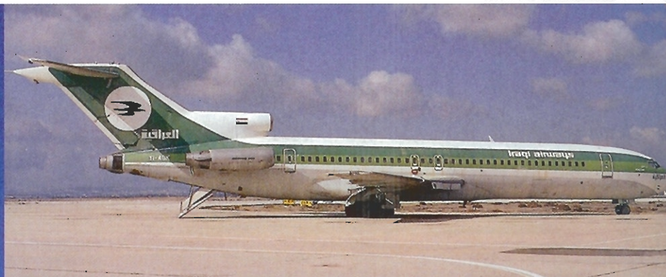
An Iraqi Airways Boeing 727 (YI-AGK), its colours faded, sits on the ramp in Amman, Jordan, where it has been parked for 14 years. A number of the airline's aircraft were moved to locations within the Middle East before the start of the first Gulf War, but it is unlikely that any of them will see further service with the airline due to their long period of storage.

The first Boeing 767-200 for Iraqi Airways is seen flying over Arizona on a flight between Goodyear and Tucson in December 2004.